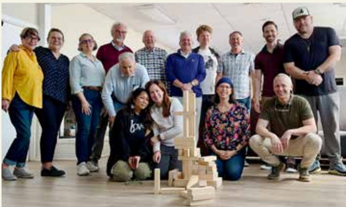
Elders' Meeting on May 11 where the discussion was what it means to "build up the body of Christ" from Ephesians 4:12.