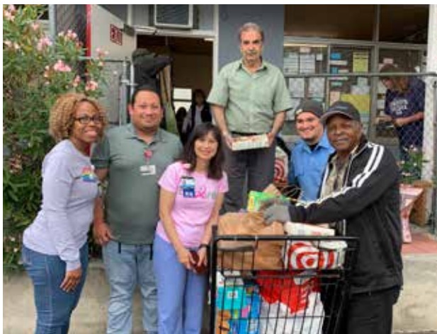
Pantry volunteers pause the food distribution for a quick photo.

The history of the Food Pantry is truly an amazing story that began with two gals nearing retirement chatting about wanting to become involved in some worthwhile project to "make a difference". It's a story about recognizing despair, food insecurity, hopelessness, applying hard work, determination and organization and bringing together a coalition of religious institutions to address the growing needs in our community.