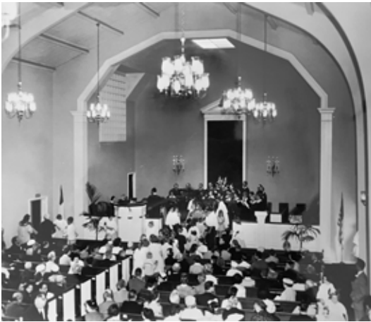
Palm Sunday Processional in the 1950s.

The Palm Sunday Processional is perhaps the most generational tradition we celebrate at our church home on the corner of Moorpark and Colfax. This Sunday, March 24, many young parents will watch their children carry flowers down the same aisle they themselves walked while growing up in our church family. Sitting next to them may be their own parents – now grandparents to the youngsters walking toward the Chancel steps. They, in turn, will remember Palm Sundays even farther back in that chain of our history.