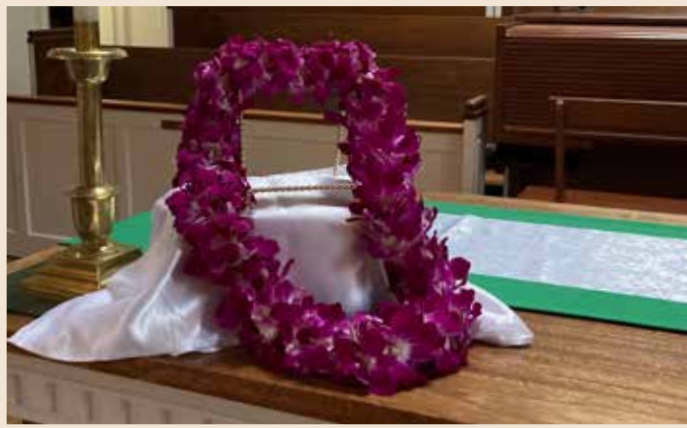
Lei on the chancel in memory of the victims of the Maui wildfires