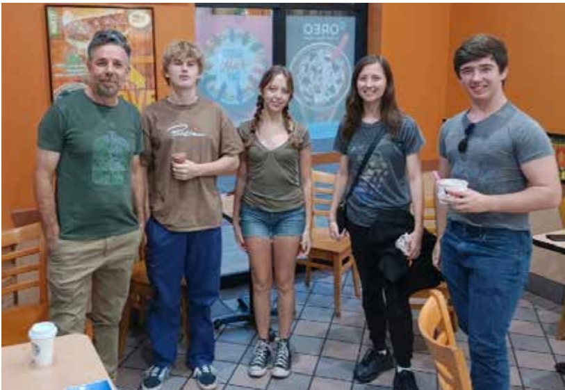
ABOVE: College send off, new senior check in, and brainstorming about the development of a young adult program. All over ice cream.